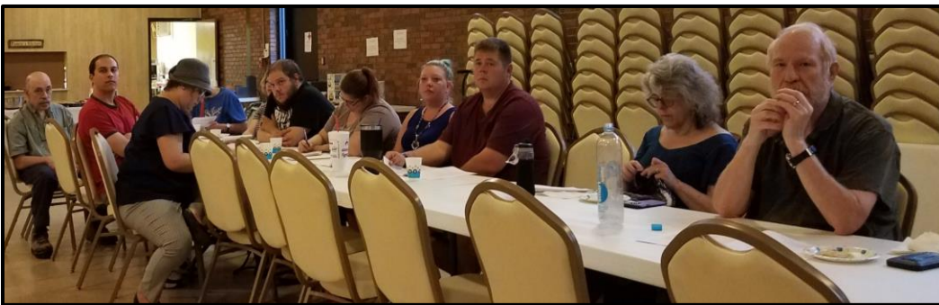
Annual Meeting Photos Temple members.