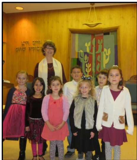
Left: 2019 Consecration on November 8